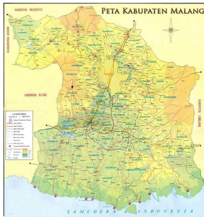
Figure 1. Administration Map of Malang Regency

This research is conducted in the irrigation areas that have farmers' association for water users (P3A) that is spreading in Malang Regency (Figure 1).