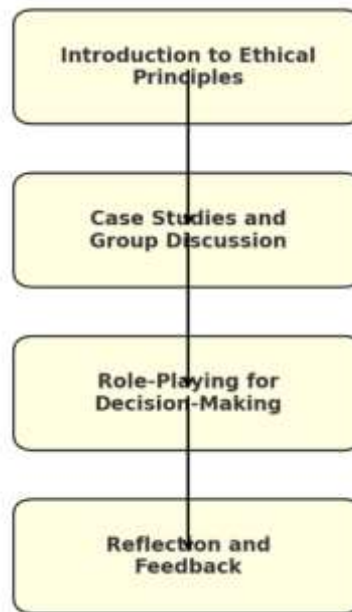
Figure 2. Flowchart of an Ethics Training Program

Achieving work-life balance is essential for preventing burnout and managing stress. Resilience training, including mindfulness exercises, stress management techniques, and self-care practices, further supports healthcare workers' mental well-being.