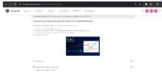
Figure 1. A Screenshot of The Video, Task, And Quiz In SYAM-OK LMS

This pre-class engagement allowed students to learn at their own pace, identifying areas of difficulty which were then addressed during the subsequent in-class sessions. The flipped classroom was supplemented with scaffolding, wherein the instructor provided targeted assistance based on students' performance in the pre-class quizzes and forum discussions. The scaffolding was designed to support students in mastering complex geometric concepts by offering personalized guidance during the in-class problem-solving activities.