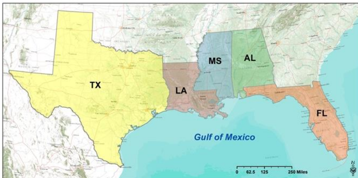
Figure 1: Gulf States map of the United States

The Gulf region of the United States, including states such as Texas, Louisiana, Mississippi, Alabama, and Florida, is facing several environmental challenges worsened by human activities. Climate change, largely caused by human actions, poses significant threats to the Gulf Coast's delicate ecosystems, communities, and economies. In this thorough analysis, we will investigate the various human-induced factors contributing to climate change in the Gulf region. These factors range from greenhouse gas emissions to land use changes and energy production. Fig. 1 depicts the five states and cities which constitute the Gulf regions and Fig. 2, highlights the various cities within the catchment of the Gulf of Mexico.