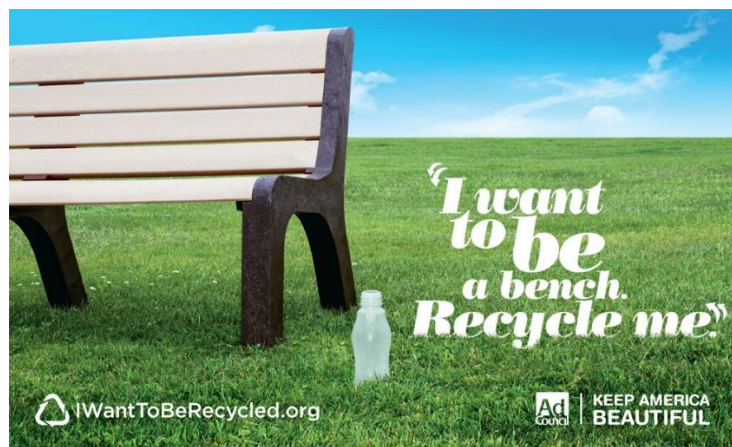
Fig.1: The Ad Council's 2013 "Recycling" Campaign

One of the primary roles of advertising in promoting sustainable brands is to raise awareness and educate consumers about environmental and social issues. Advertising campaigns can serve as powerful platforms for conveying information, raising consciousness, and inspiring behavioral change. For example, advertisements may highlight the importance of recycling, reducing waste, conserving energy, or supporting ethical labor practices. For example, (Fig.1) The Ad Council's 2013 "Recycling" Campaign is an excellent example of an advertising initiative aimed at promoting sustainable behavior. Through compelling visuals and clear messaging, the campaign encourages consumers to recycle their waste and highlights the environmental benefits of recycling.