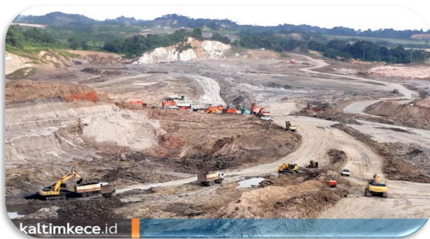
Figure 1. Open pit mining and its conditions

Implications of coal mining management Communities living around mines are often directly affected by mining, both in terms of environmental change, climate change, natural physical changes such as floods and changes in social conditions (Huang et al., 2021; Rahmayani et al., 2023). They must benefit commensurate with the damage caused and have access to economic and social opportunities (Luthfi, Andi, 2023). As in the picture below, that the mining system that takes place uses an open system so that it allows fatal risks to arise in accordance with the principles in mining, namely large costs, high technology, risks and impacts are also large.