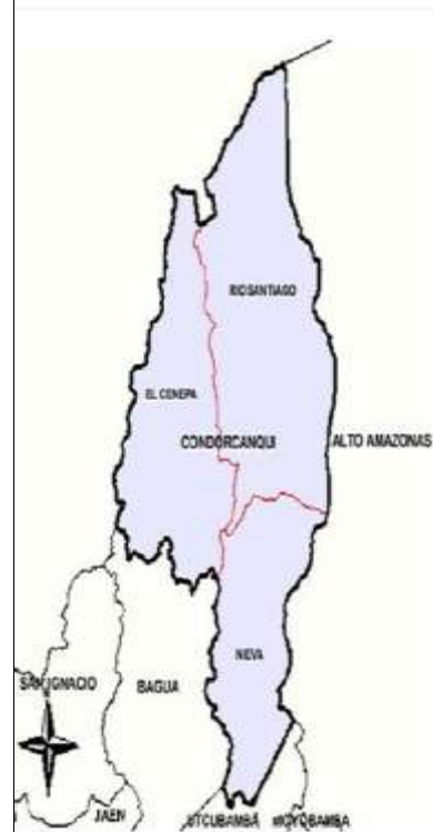
MAPA DE LA PROVINCIA DE CONDORCANQUI

Analysis of required investments and available sources of financing.