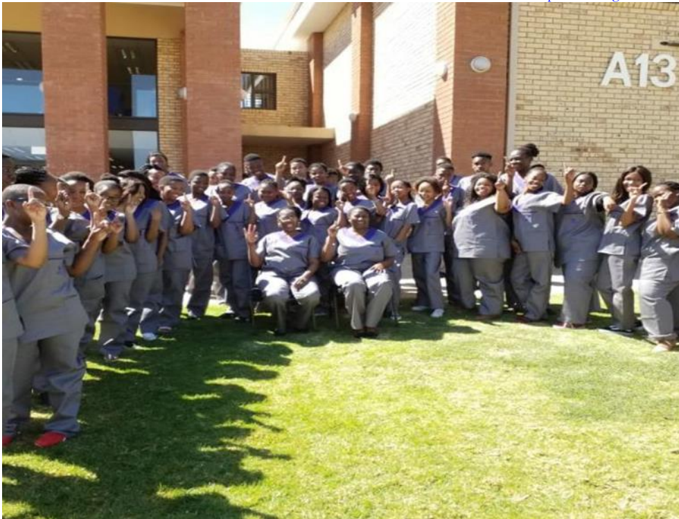
Fig 4.2.3.1 NWU Registered nursing students: women dominated.

The interviewees confirm what the literature presented earlier suggests, that despite the worldwide rise in the quantity of men enrolled for the nursing program, programs of nursing are still largely based on a female worldwide (Lyu et al. , 2022; Organization, 2020). Men in nursing still suffer for being enrolled in the program because the programs favour men more than women.